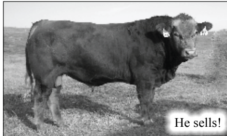
KBSR T13 ~ Gunner Son

EPDs: 3.9 | 4.2 | 46.3 | 76.1 | 1.3 | 3.5 | 26.7