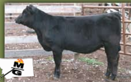
MHR Dream Girl U72 Open MAAS True Dream 404P x MHR Power Lady