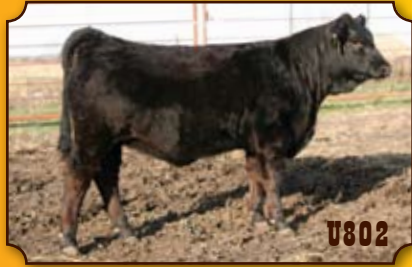
MJ Miss Annie O U802

PPSR Nophalt x Black Mick Proj. EPDs: 5 3.6 35 68 4 8 25 BD: 1/28/08 • BW: 85 lbs.