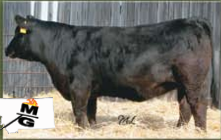
LRS MS Malta 723T NLC Malta L132M x LRS Paramount 68M Bred to HC Hummer