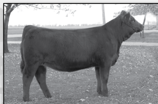
JSF Fancy and Free 264U

BD: 1/25/08 • BW: 91 Freedom x HS/Hook's Good Fortune 2 Proj. EPDs: 7 • 0.7 • 36 • 75 • 7 • 11 • 29