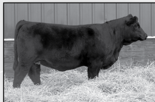
BCLR Miss Ingrid U810

BD: 2/26/08 • BW: 97 • WW: 706 Crockett x Hummer EPDs: 5 • 2.7 • 49 • 82 • 4 • 3 • 27