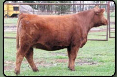
THSR Trina T708 • PB Simmental

Tyra has attracted a lot of attention since she was a calf. This Simm-Angus female is extremely attractive with a great disposition. She is by far the best Simm-Angus female we have ever raised, one look and you will see why. Tyra is homozygous polled, homozygous black and ultra sound safe to GWS Trademark.