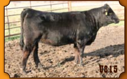
MJ Miss Dreamer U815

CNS Dream On x SRS Preferred Beef Proj. EPDs: 11 0.7 32 57 5 5 21 BD: 2/5/08 • BW: 88 lbs.