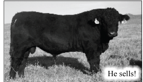
KBSR T14 ~ TNT Five Star Son

EPDs: 3.9 | 4.2 | 46.3 | 76.1 | 1.3 | 3.5 | 26.7