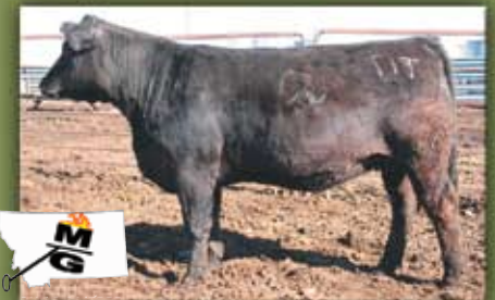
BDV Renee T17 Brooks Above Par x Bullet 37K Bred to Ellingson Legacy "Olie"