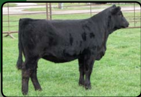
THSR U 814

Trina is a very well balance female in term of phenotype, pedigree and EPD's. She is extremely attractive with a big hip and plenty of rib. Trina's mother was purchased a few years back at the Classis Sale from Rocky Hills and has done an excellent job for us. Trina is ultra sound safe to Wheatland Red Teddy.