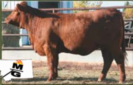
MFSR Hot Rod 217T WCS MR Hot Rod 210 M x 602M Bred to ER Big Sky 545B