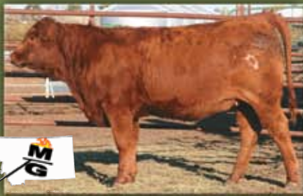
MFSR Dream 403U CNS Dream On L186 x Black Shamrock