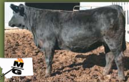
BDV Bobbie 6S51 BDV Accelerator 62N x Bridle Bit Miss H836 Bred to 8CC Hustler

Nelson Livestock Company Prickly Pear Simmental Rymo Cattle Co. Spring Valley Simmental Western Cattle Source