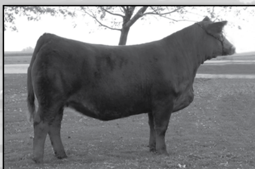
JSF Trixie K254T

For updated pictures go to: www.johnson-bichlersimmentals.com