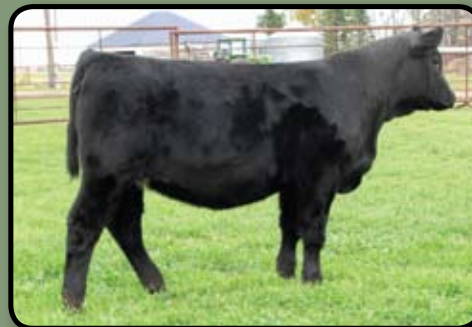
THSR U844 • 1/2 Blood SimAngus

U814 is a solid black Powerline out of a Fortune 500 dam that we purchased for Nelson Livestock a couple of year ago. U814 is easy doing, moderate framed and will make a great brood cow.