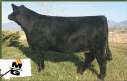
MS Sunnys Dream T01 Hooks Shear Force 38K x LBR MS Sunny R545 Bred to Wheatland Bull 6805