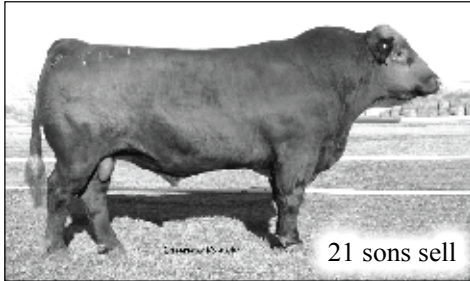
TNT Gunner N208

Friday, January 30, 2009 1:00PM CST At the Ranch 1589 95th Ave NE McHenry, ND 58464