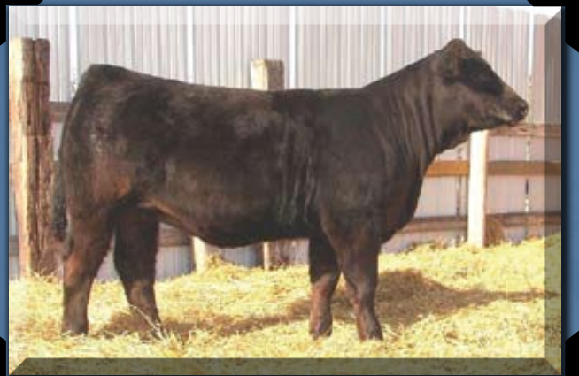
BTS Ms Gun Powder 814U KenCo/MF Powerline 204L x SAC Mr MT 73G EPDs: 4 0.8 26 50 1 10 23