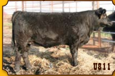
MJ Ugly Betty U811

TNT Dynamite Black x Meyers Black Dakota Proj. EPDs: 4 3.5 38 66 4 5 24 BD: 2/3/08 • BW: 100 lbs.