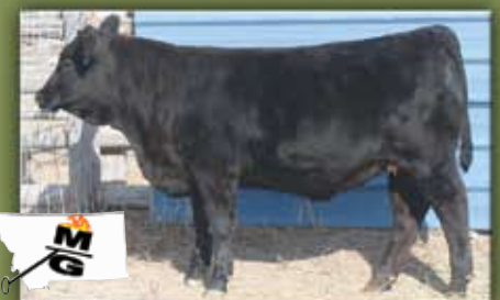
LBR MS Main Force U813 Hooks Shear Force 38K x Red Titan HRN315