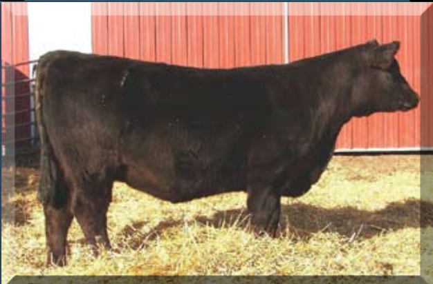
BTS Black Magic 810U KMK Alliance 6595 I87 x RFS H91 EPDs: * 0.3 44 85 * 7 29

This Powerline heifer has the look to go many places. She is a sweet fronted as you will find, with tremendous volume and rib shape. Her mother has been a super cow for us with her first heifer calf being retained in our herd, followed up by this super complete female. Ms.Gun Powder will be one to watch this summer when the Jr shows roll around.