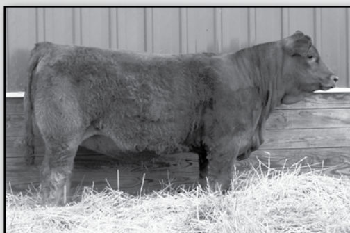
BCLR Miss Ulma U808

BD: 2/22/08 • BW: 82 • WW: 678 Freedom x Good A Nuff EPDs: 73 • -0.5 • 40 • 76 • 4 • 6 • 26