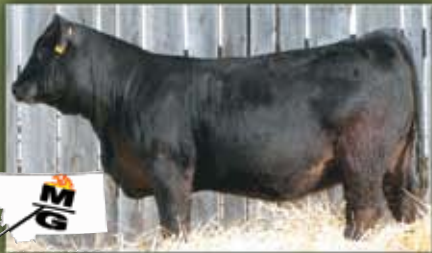
LRS MS Hummer 852U HC Hummer 12M x ES Kilowatt