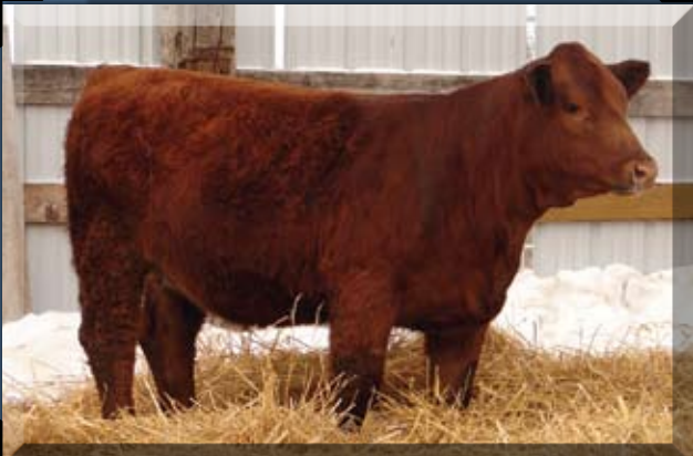
TT Annie Okley 827U TNT Gunner x KS Black Cloud EPDs: 6 2.5 42 71 3 10 31