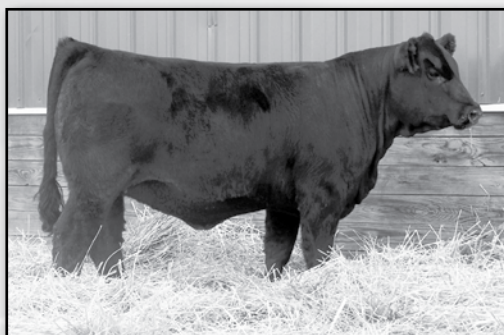
BCLR Miss Phoebe U817

BD: 3/4/08 • BW: 93 • WW: 634 Triple C Invasion x Mr. MT EPDs: 9 • 1.8 • 27 • 49 • 0 • 8 • 21