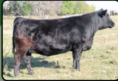
THSR Tyra T734 • 1/2 Blood SimAngus

Trudie is one of the most complete females that we have ever raised. Trudie is moderate framed, easy keeping, with a ton of middle and brood cow written all over her. This female definitely will be a great donor prospect for her new owner. She is Homozygous Polled, a Non-Diluter and ultra sound safe to Wheatland Red Teddy. You won't want to miss an opportunity like this to own a great female like Trudie.