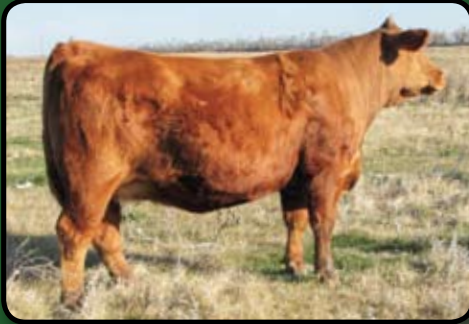
THSR Trudie T27 • 3/4 Blood SimAngus