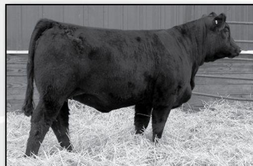
BCLR Miss Ursula U813

BD: 2/27/08 • BW: 93 • WW: 642 Triple C Invasion x Mr. MT EPDs: 9 • 1.8 • 27 • 49 • 0 • 8 • 21